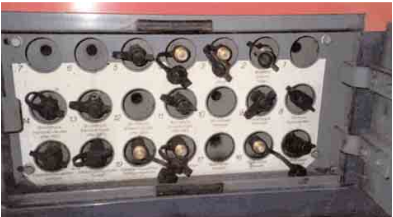
Figure 9 Test points which can be used to charge individual air circuits

(normally an 'n'-type coupling or 'ISO'-type fitting) behind the front panel that can be coupled to the recovery vehicle. Often brake circuits have dual