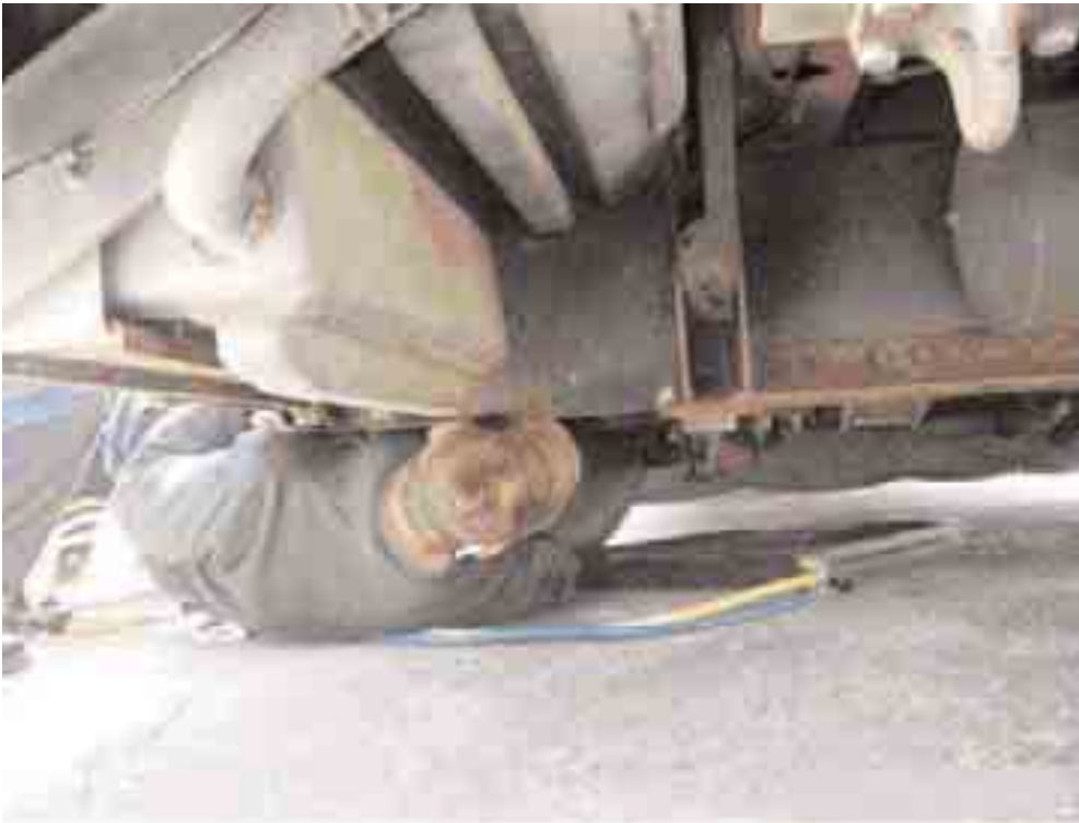
Figure 2 Clearance on a conventional bus with inflated suspension

should be able to demonstrate their competence and working knowledge before they are allowed to undertake work activities alone and unsupervised. Technicians should understand their duties and responsibilities relating to the recovery of vehicles. They should attend regular refresher and updating courses to ensure they are aware of current legislation, new techniques and advances in equipment. Further details on the minimum content of recovery training is provided in BS 7121 Part 12. 1