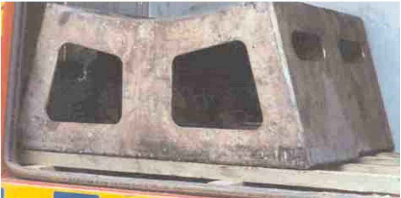
Figure 12 Proprietary wheel stands used to support a vehicle once it has been jacked up