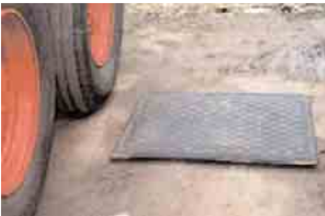
Figure 13 Air cushion jack deflated