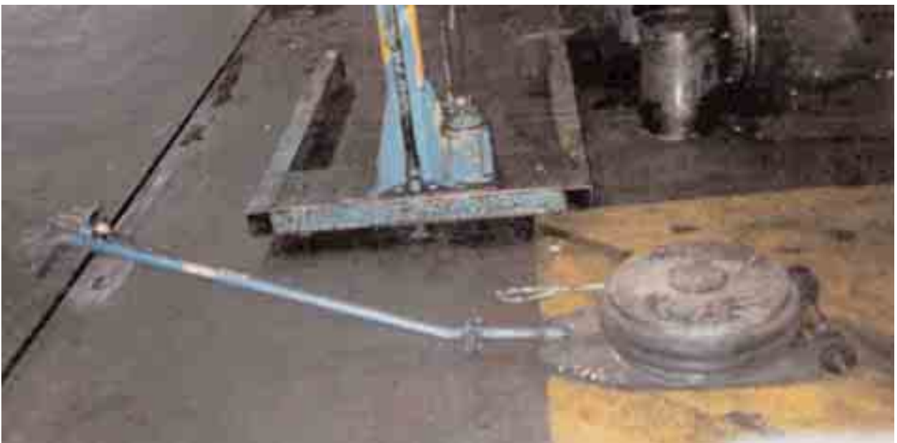
Figure 16 Long-handled air jack

46 Jacks with long handles, as shown in Figure 16, are particularly useful as the jack can be pushed under the vehicle without crawling under to locate it. Similarly, wooden poles such as brush handles can be used to position stands and props to avoid crawling under the casualty vehicle, but care is needed to ensure the jack aligns with the jacking point.