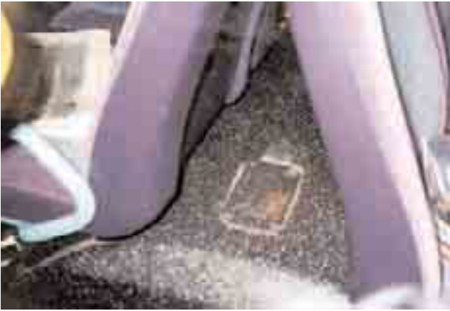
Figure 6 Small access panel between seats giving limited access to spring brake chambers

However, these features can deteriorate with age as panels become seized or covered over. Furthermore, some access panels are large while others only provide limited access, as shown in Figure 6.