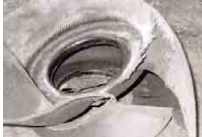
Figure 7 Typical bellows that has been over inflated

25 Even without tampering with the ride height, a bellows can deflate suddenly and unexpectedly due to a failed pipe or a fall in system air pressure.