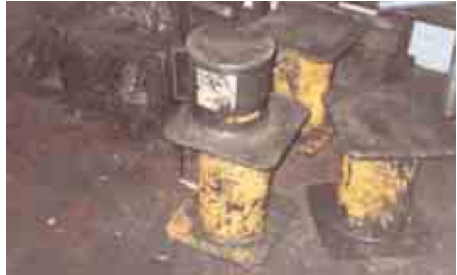
Figure 11 Proprietary steel stands for propping vehicles