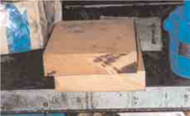
Figure 10 Typical hardwood blocks for general-purpose use