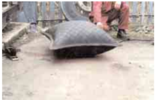
Figure 14 Air cushion jack inflated

45 Hydraulic jacks come in many different forms but it is common for low buses to use sets of jacks, where a low-profile jack initially raises the vehicle enough to place a larger jack underneath. This procedure is