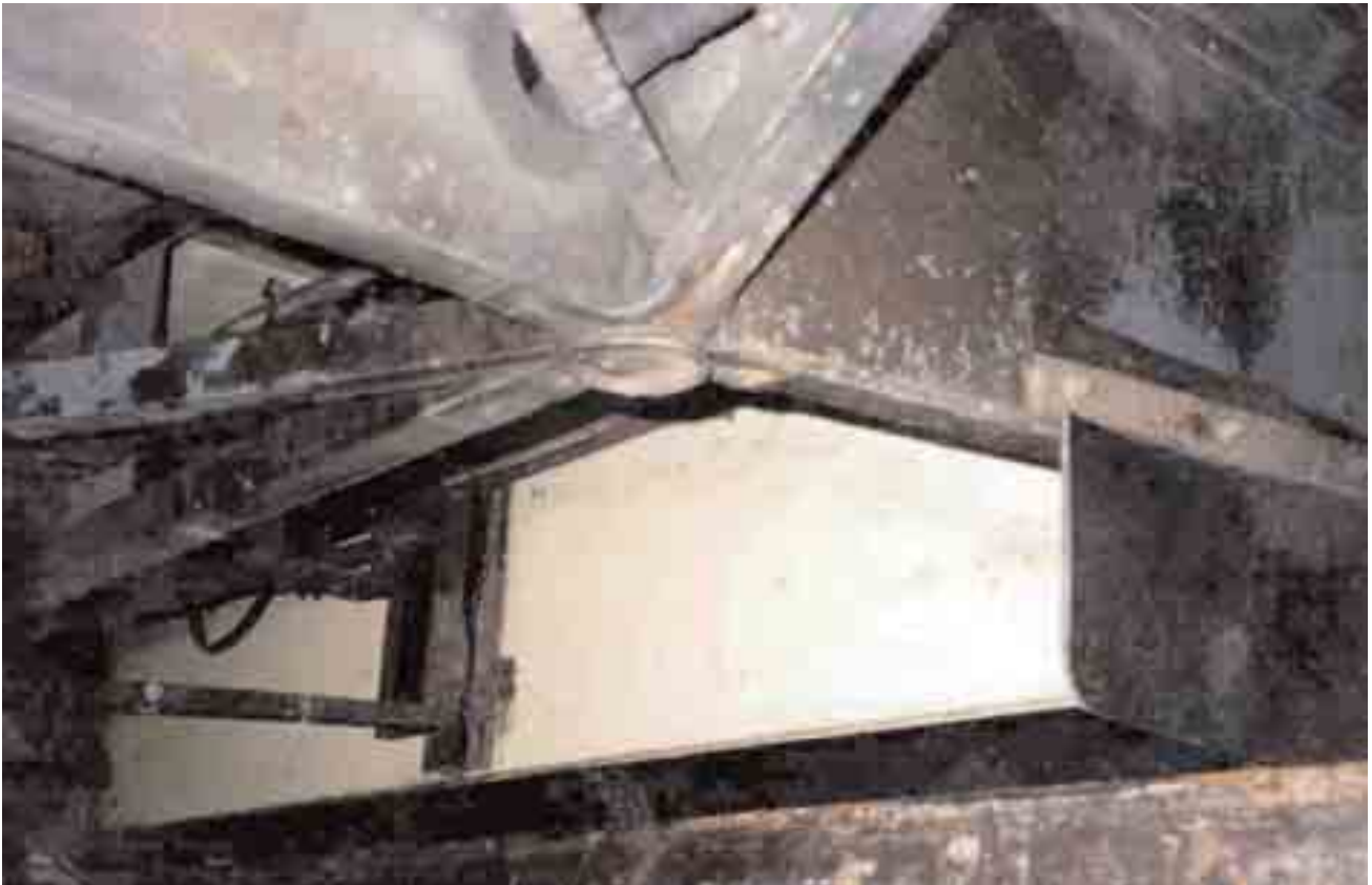
Figure 8 Jacking point on a space frame vehicle