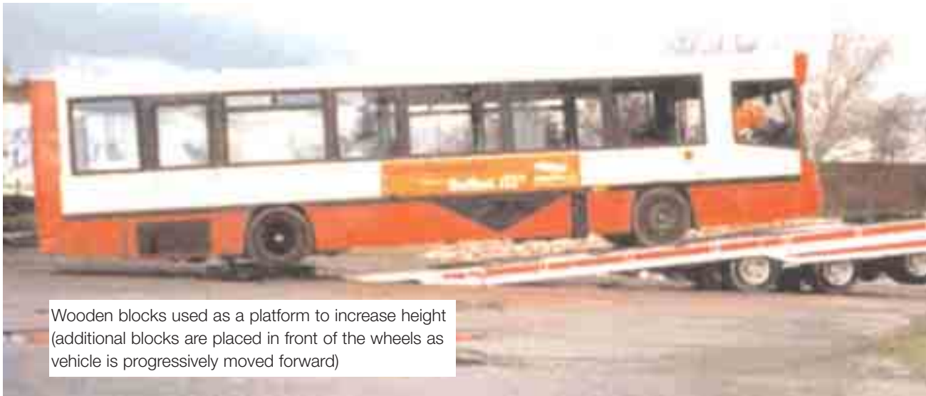
Figure 4 A low bus being successfully winched onto a low loader using wooden blocks to increase vehicle height

16 When winching a casualty vehicle onto a low-loader trailer, it is essential to create and maintain a safe working area, with special attention to pedestrians and other road users. Nobody should be allowed to stand behind the casualty vehicle during winching. Remote-controlled winches make this process safer because the technician can control the winch from a safe position where they are not at risk of being struck, but are able to move around to gain a clear view of the operation. They should avoid the need to climb onto the trailer/bus but if absolutely necessary, precautions should be in place to avoid falling from height.