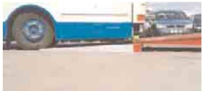
Figure 3 A low bus being successfully winched onto a low loader using ramps