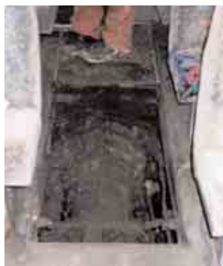
Figure 5 Large access panel to give full access to spring brake chambers

20 Despite a large number of components being located beneath vehicles, it is often possible to access many from above via access panels in the vehicle floor or through panels in the side of the vehicle. For example, the spring brake chambers often have access panels above them, as shown in Figure 5. Wherever possible, these access features should be used in preference to crawling beneath the vehicle.