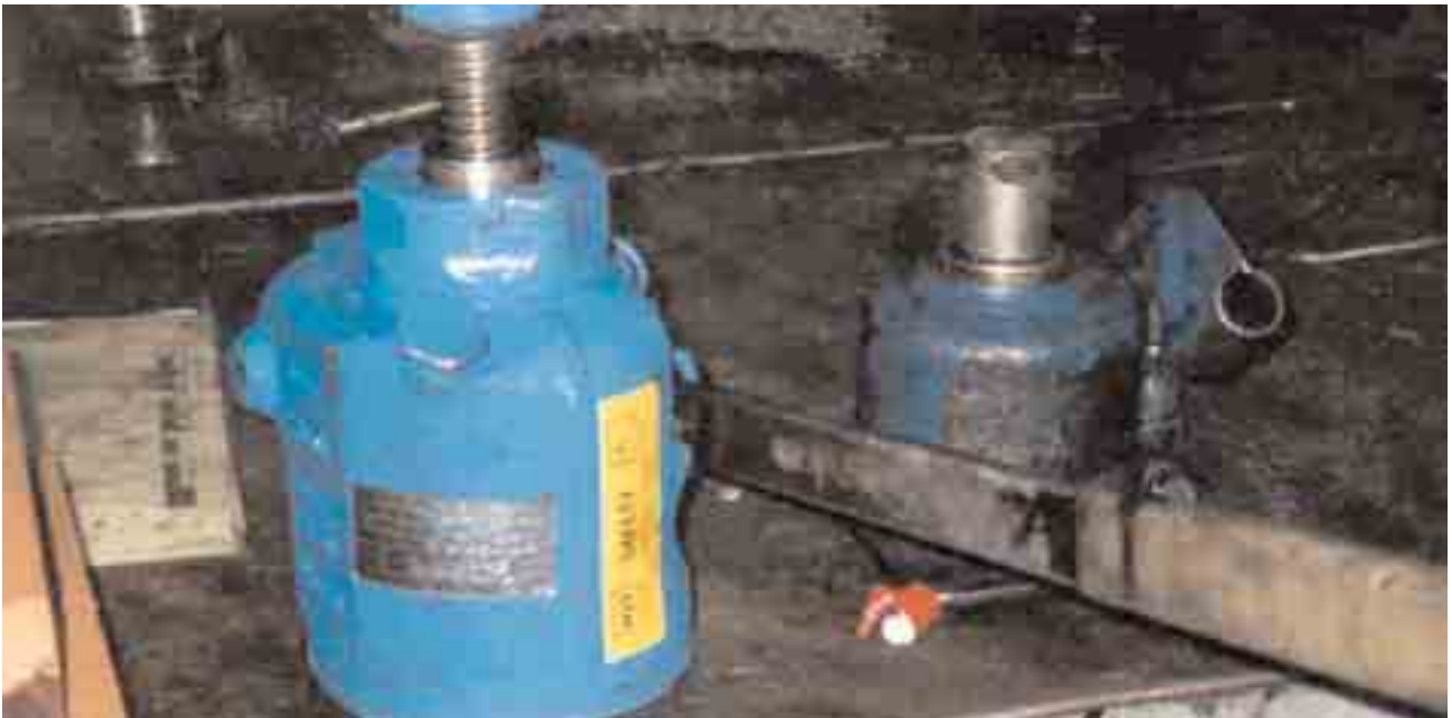
Figure 15 Typical hydraulic jacks in a range of sizes