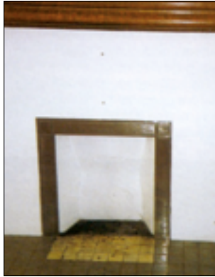
AIB fire surround