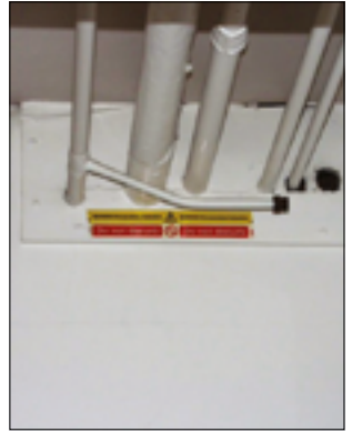
Don't assume there will always be warning signs. There could be undiscovered asbestos in buildings you work on