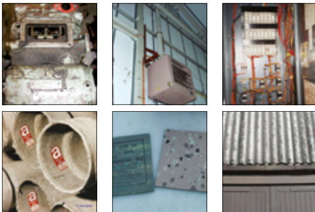
Top row: An asbestos gasket, asbestos cement pipes and an asbestos-containing fuse board Bottom row: The asbestos cement pipes are labelled, so are the tiles, but you might not know until you start to lift them. There could be sprayed limpet under the AC sheeting