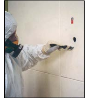
Seal the drilled edge with sealant