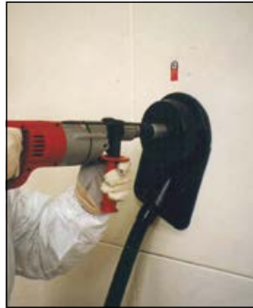
Control measures: shadow vacuuming and using drill cowls as local extraction