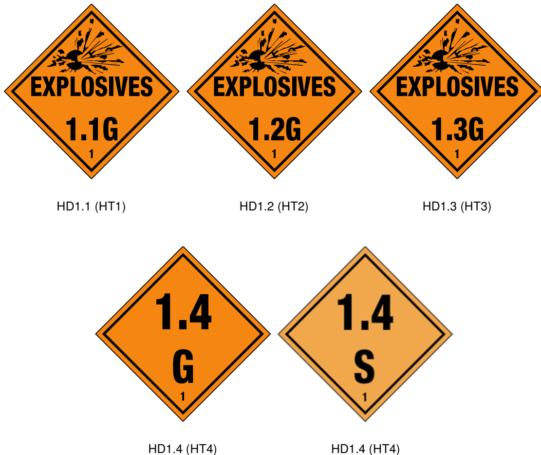
Figure 1 - transport classification labels

1 The cartons used as transport packaging for fireworks will be labelled with an orange diamond similar to those shown in figure 1. The orange diamonds identify the hazard division (HD) that the fireworks have been classified in for transport. The hazard division can then be used to determine the indicative hazard type (HT) for storage.