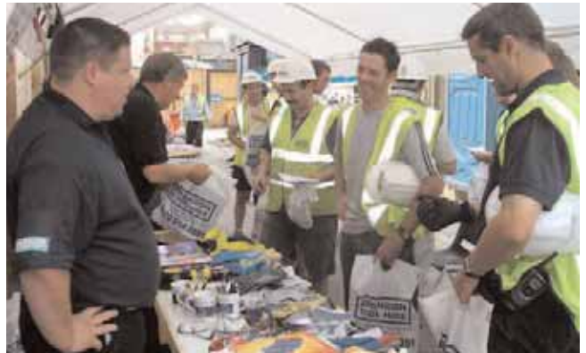
Figure 5 Working Well Together roadshow

Working Well Together roadshow – In common with other DWP sites in Hampshire, the Southampton site has hosted its own roadshow, bringing in a range of manufacturers and service providers to demonstrate best practice. The highlight of the Southampton roadshow for many was the practical demonstration of a face fit test for disposable mask users.