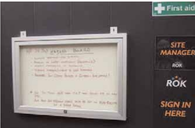
Figure 3 Hazard board

Hazard board – A large weatherproof white board is fixed outside the main site office, where workers sign in each day. The site manager regularly updates this board with information about current/imminent work activities, their key hazards and any preventive and protective control measures required. Any ‘one-offs’ or anything unusual happening on site that may cause a hazard is also highlighted.