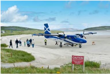
Picture 4: The transport used by the Investigation Team to reach the Isle of Barra