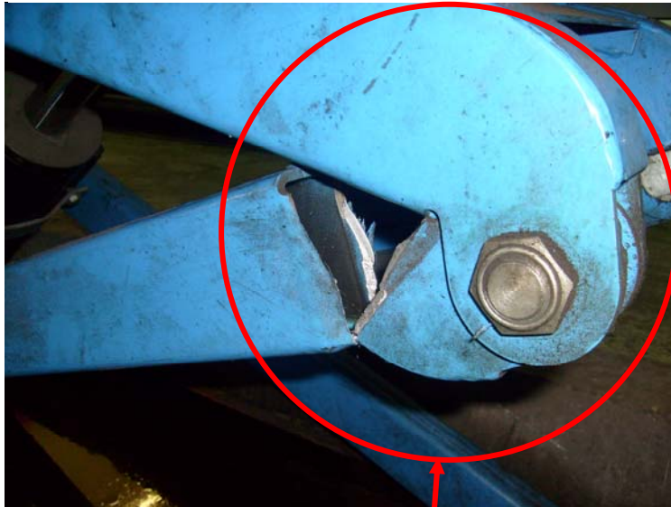
Photograph 2 - failed section of the lifting arm