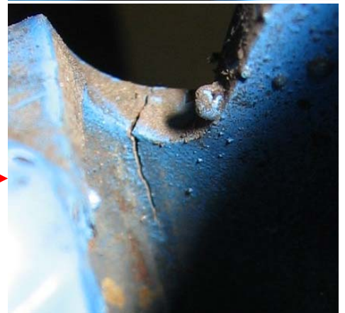
Photographs 4 and 5 showing cracks in similar lifts