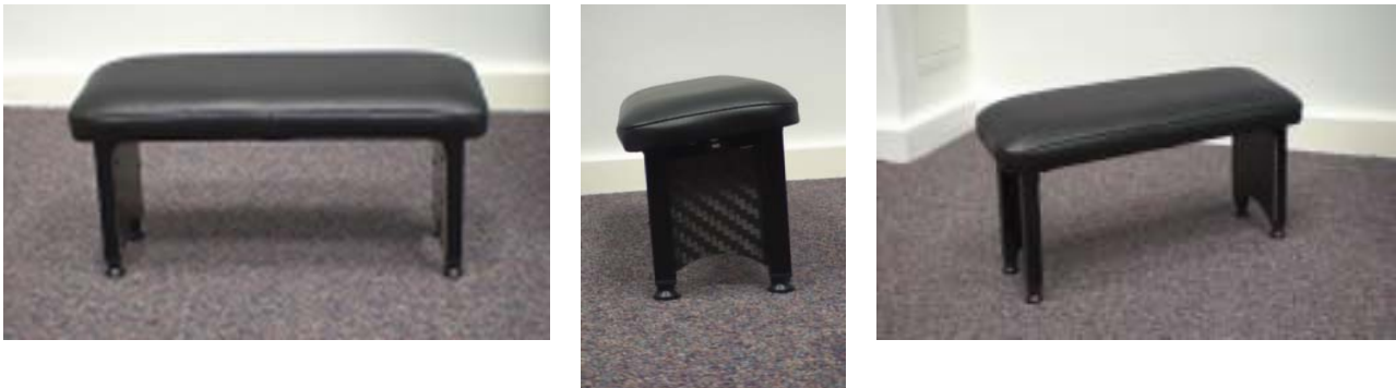
Figure 2: Kneeling stool

The limited height adjustability of the stool, afforded by threaded feet on each leg allowing a range of heights of 219 – 240 mm to the centre of the seat from the floor. Allowing for discrepancies due to the leather bound, soft foam covering of the stool, the dimensions of the stool are 480mm wide by 160mm.