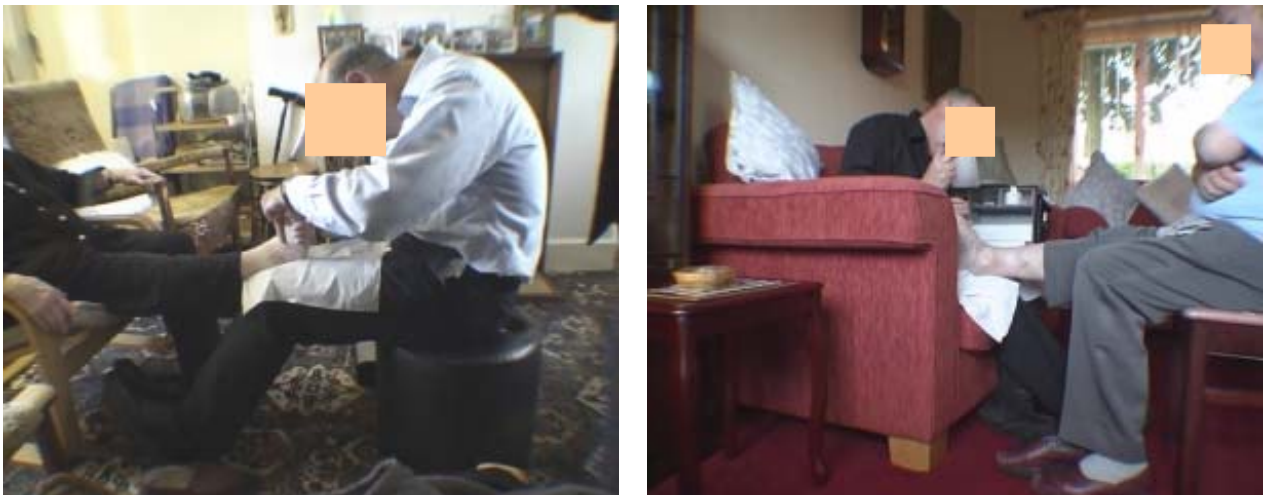
Figure 4: Examples of common postures adapted by podiatrists in domiciliary settings.

During domiciliary treatments podiatrists usually use seating available in patients' homes, and so adopt different postures depending on the environment and the variation of seating provided. It was common practice, as has been observed during previous work, that the client's foot was placed on the knee of the podiatrist when working. Due to podiatry being such a visually demanding task, podiatrists often have to adopt very awkward postures to allow them to gain the hand-eye coordination that is needed to perform their treatments. Figure 4 demonstrated two examples of such postures where the podiatrist are assuming a bent over posture with near maximal flexion in the neck to look at the top of the foot, while reaching forward with both hands to perform a treatment in a fixed posture for few minutes duration.