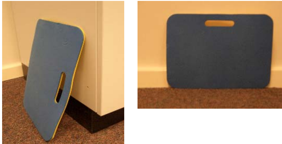
Figure 1: Kneeling mat