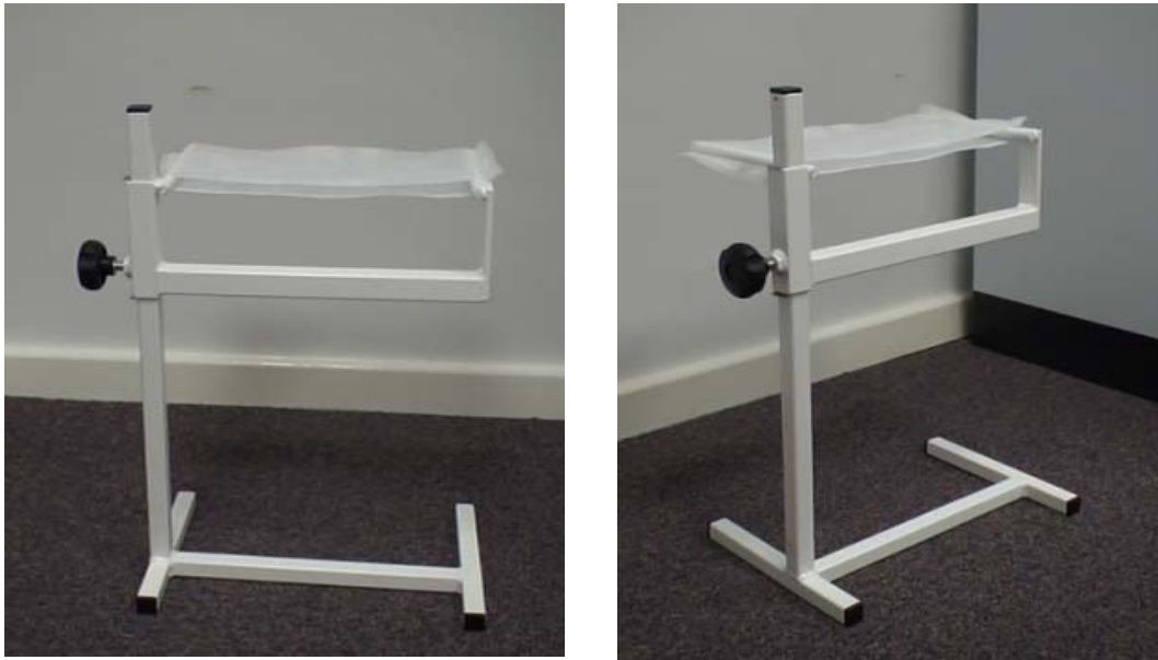
Figure 3: Patients leg support

A total of twenty-eight treatments were observed with seven different podiatrists. During the visits the podiatrist conducted some treatments without using the equipment (thereby performing their usual routine) and the other treatments using the equipment described above. No attempt was made to influence the nature of the clients' treatments and these appeared to be random and representative of each podiatrists normal treatment regime. The client's permission was sought for the filming of the treatments.