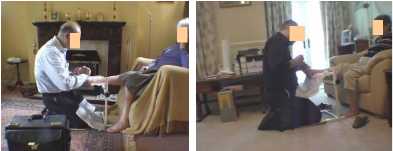
Figure 5: Examples of postures adapted when using the equipment.

The stool and kneeling mat reportedly offers a reduction of bodyweight loading on the lower limb joints and soft tissue combined with reducing loading on the patella-femoral joint and pre-patella bursae, via the provision of the padded kneeling stool. The patient's limb support helped in reducing the need for the podiatrist to lift and support the weight of the leg while treating with the free hand.