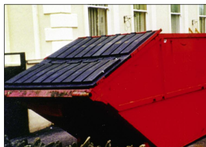
Use a lockable skip for asbestos cement sheet