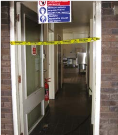
Make sure you restrict access