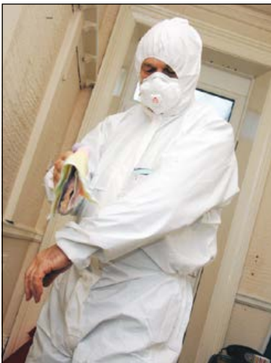
Cleaning with damp rag using patting action