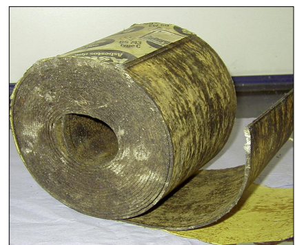
Floor tiles that contain asbestos can also have asbestos-paper backing, or be fixed with asbestos-containing mastic