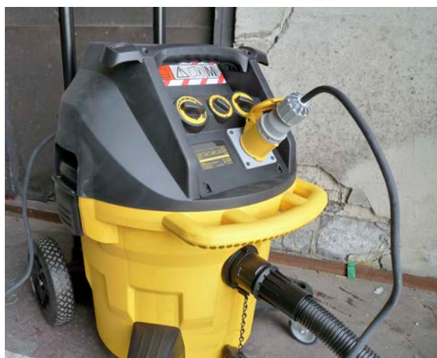
Figure 3 Examples of different extraction units