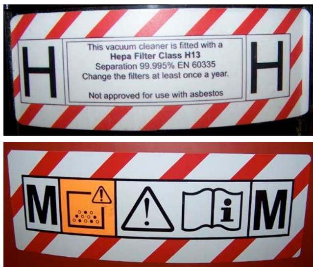
Figure 4 Examples of labels on H and M class extraction units