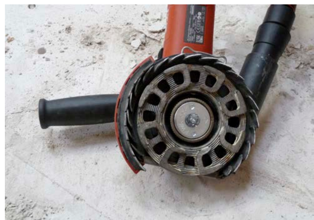
Figure 1 Tools and accessories providing for effective dust removal