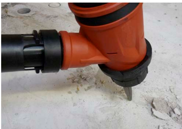
Figure 2 Examples of captor hoods on a grinder and breaker