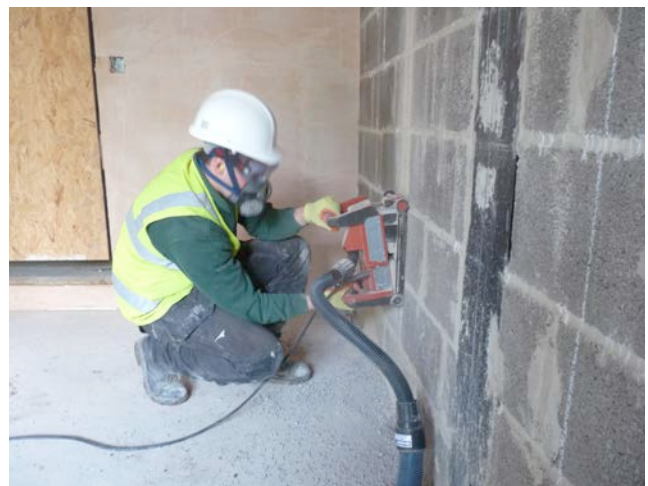
Figure 4 Wall chasing using on-tool extraction