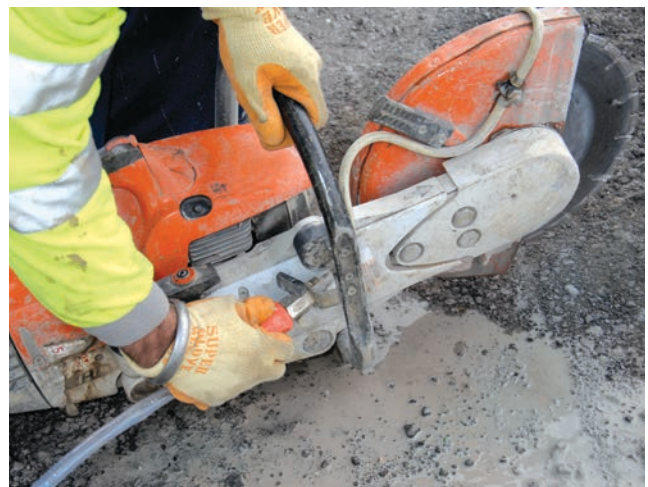
Figure 3 Water suppression on a cut-off saw