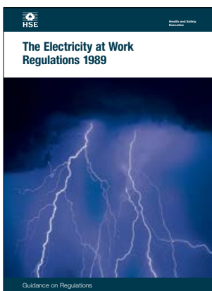
HSR25 (Third edition) Published 2015

This new edition of HSR25 will help dutyholders meet the requirements of the Electricity at Work Regulations 1989. It will be of interest and practical help to all dutyholders, particularly engineers (including those involved in the design, construction, operation or maintenance of electrical systems), technicians and their managers.