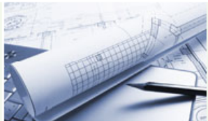
View designs and make a comment