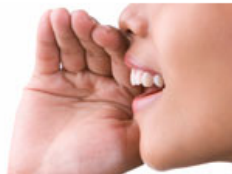
How to get involved