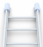
Progress so far