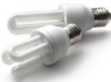
New nuclear programme

The HSE and Environment Agency are working together to make sure that any nuclear power station built in the UK meets the highest standards of safety, security, environmental protection and waste management.