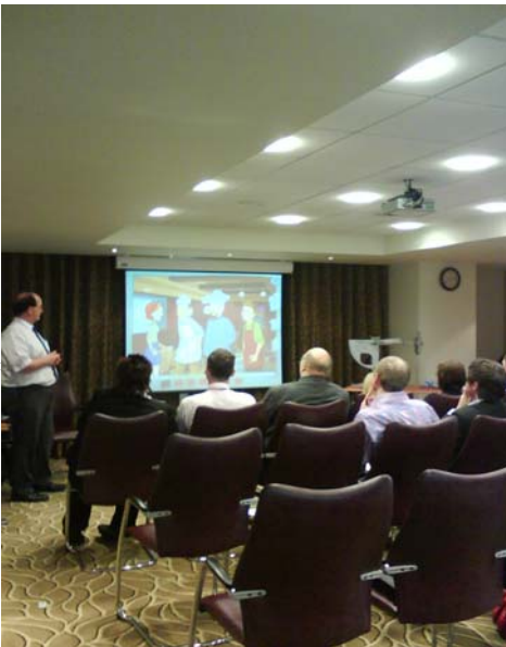
Delegates were split into smaller groups for presentations

"it was a well run course & well presented and very well organized"