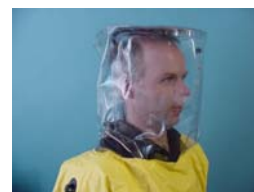
Fig.6 Powered hood/blouse