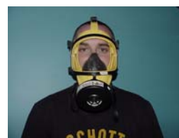
Fig.3 Full-face mask