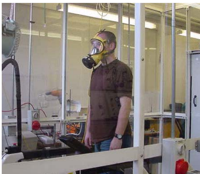
Fig. 8 Laboratory test chamber method

63 This method employs a test that is based on European Standard inward leakage test for product certification under the Personal Protective Equipment Directive. The details of the principle of the test methodology are described in BS EN 136, 10 BS EN 140 11 and BS EN 149. 9 The test can be carried out in a chamber (see Fig. 8) into which a standard challenge of either sodium chloride (NaCl) aerosol, or sulphur hexafluoride (SF 6 ) gas can be delivered. The leakage of the test challenge into the facepiece under test is measured while the wearer walks on a treadmill and performs a series of exercises. The extent of the test agent leakage is expressed as percentage inward leakage and then converted to fit factors, (see Appendix 1 equations 1 and 2). This is a very versatile, sensitive and established test method, but costly to perform.