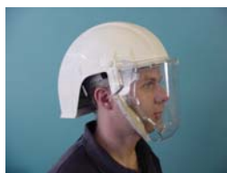
Fig. 5 Ventilating helmet