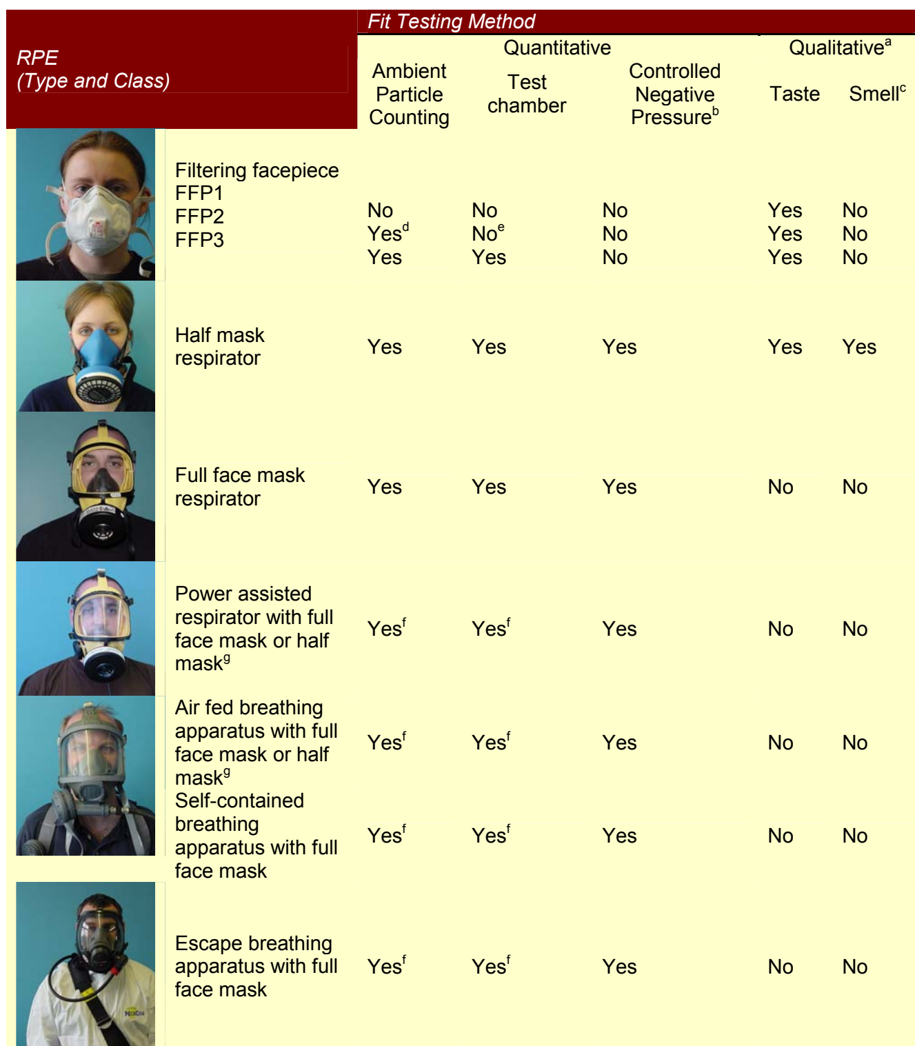
Table 2: Fit test method selection