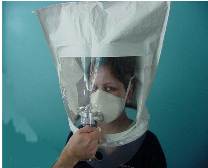
Fig. 7 Qualitative fit test - taste