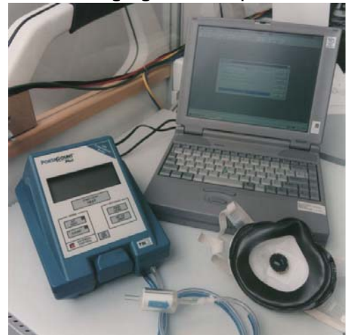
Fig. 9 Portacount fit tester

Types of RPE that can be fit tested with this method include: