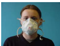
Fig. 1 Filtering facepiece

10 These are filtering facepieces, half masks and full-face masks (see figs 1, 2 & 3). Visors, helmets, hoods and blouses are loose fitting devices (see figs 4, 5 & 6).