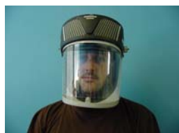
Fig. 4 Ventilating visor