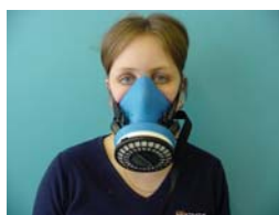
Fig. 2 Half mask