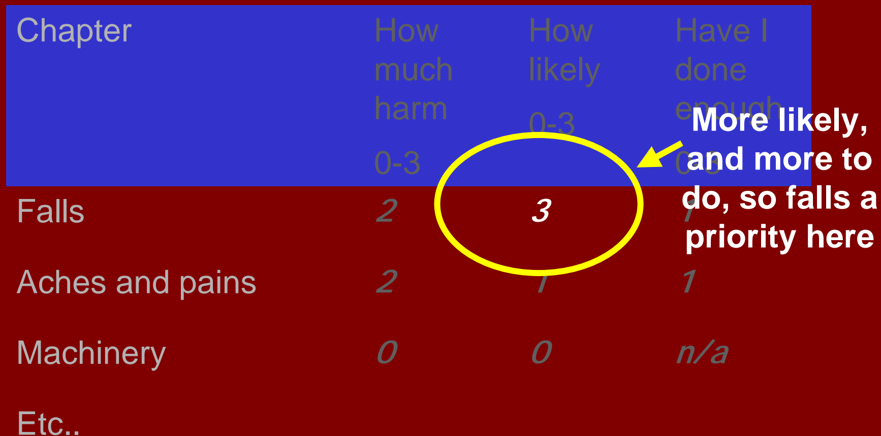
Table to help you think through