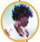
African Caribbean Hairdressing