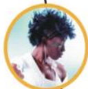
African Caribbean Hairdressing