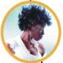
African Caribbean Hairdressing