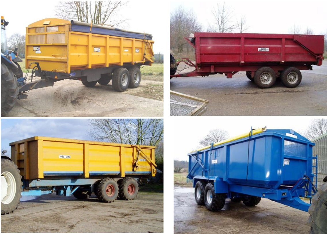
Figure 2:- Selection of trailers tested to-date