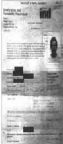
Target paper: This can be obtained for an 80c fee

Bedfordshire on Sunday gave details of illegal workers in the Home Office press office including company names, individual names, the national insurance numbers being used and employer codes. The newspaper also showed signs of a paper doctored and in an attempt to mislead. When this is read, the newspaper appears to have been doctored. Legal documents are available in Bedfordshire. Not one of the 1000 people who are working illegally in Bedfordshire. Legal documents are available in Bedfordshire. Not one of the 1000 people who are working illegally in Bedfordshire.