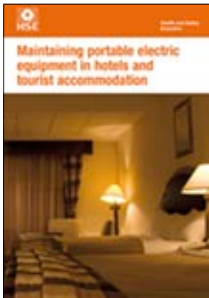
This is a web-friendly version of leaflet INDG237(rev1), revised 04/11

This leaflet sets out precautions which you can take to prevent danger from the use of portable electrical equipment in hotels and tourist accommodation. There are many different working environments in hotels. Some are low risk, such as offices and bedrooms, some higher risk, such as kitchens and laundries. The precautions for preventing danger need to be matched to these risks but should not be elaborate or expensive.