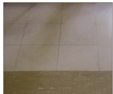
Interior floor tiles