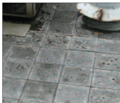
Asbestos cement tiles on a roof