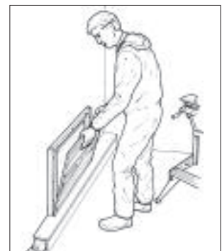
Use non-asbestos boarding to protect asbestos