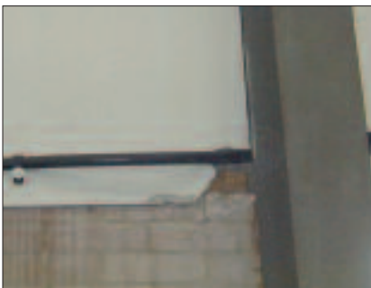
This damaged AIB needs to be covered and protected from further damage