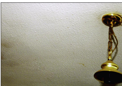
Textured coating on a ceiling