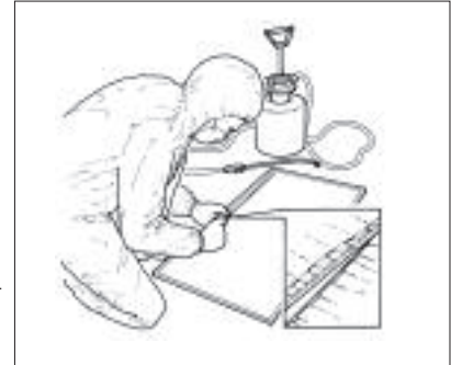
If you can't remove the paper whole, cut it - don't tear - and dampen it as you go.