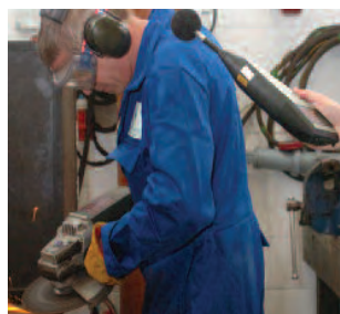
Figure 6 Farm workshop tasks may require assessment