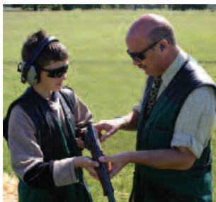
Figure 7 Shooting produces sudden, loud pulses of noise