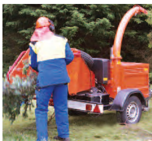
Figure 3 Wood chipper