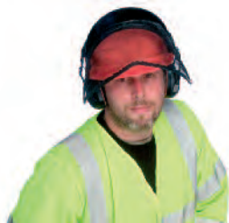
Figure 4 Chainsaw users need suitable hearing protection