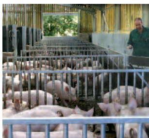
Figure 5 Pigs housed indoors can generate high noise levels