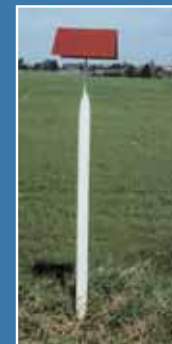
Plain orange with white stick

BPA ConocoPhillips Total/Huntsman have similar aerial markers to left