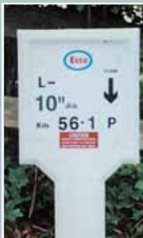
Esso marker posts