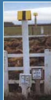
GPSS aerial marker