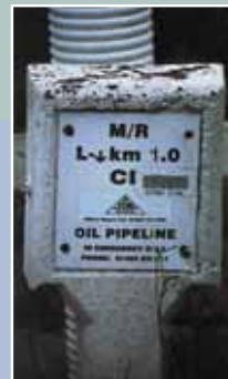
GPSS marker post