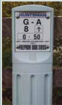
Huntsman marker post