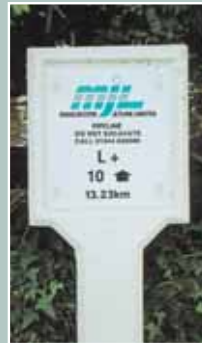
MJL marker post