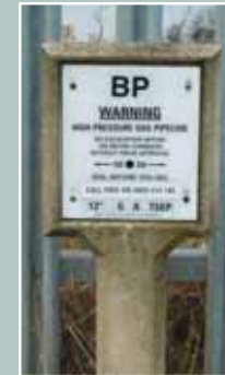
BP marker post