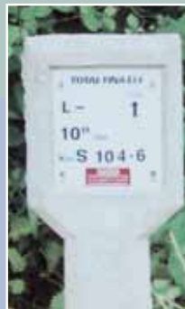
Total marker post