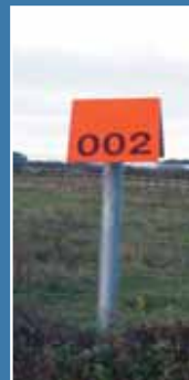
BP aerial marker