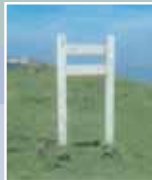
Stile warning marker