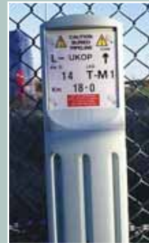
BPA marker post