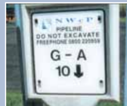
Shell marker posts