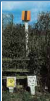
Esso & MLP aerial marker