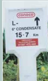
ConocoPhillips marker post