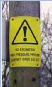
Pole warning marker