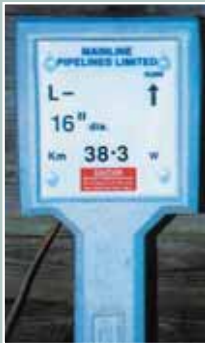
Mainline marker post